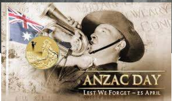
The Junior Primary students made an Anzac Day poster that will be on display at the RSL.