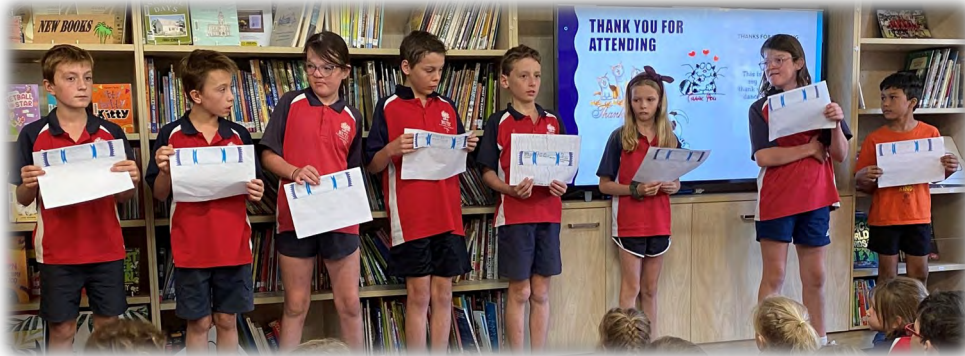
Upper Primary students presented their neurodiversity quotes