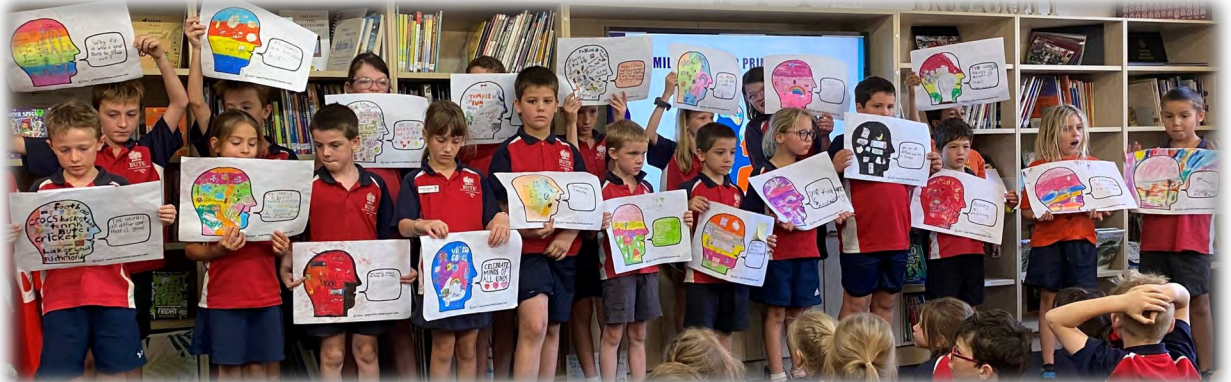
Middle & Upper Primary students showed us their artwork for neurodiversity week