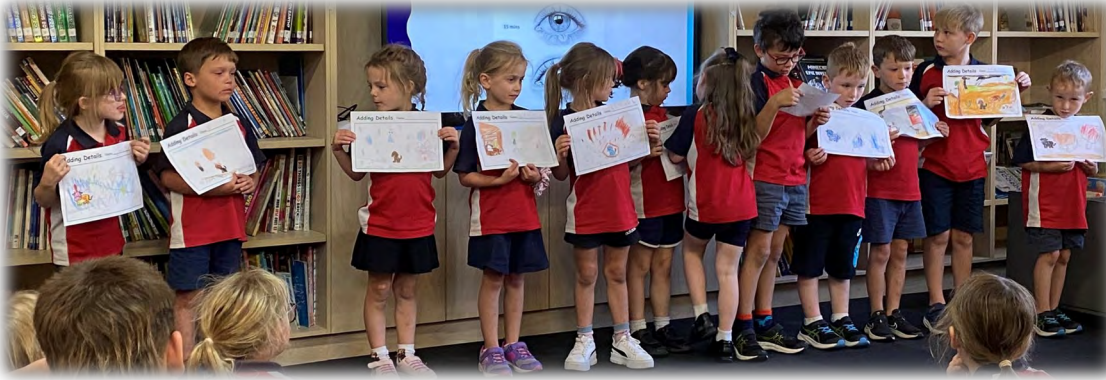
Junior Primary students presented their work about adding details to their drawings